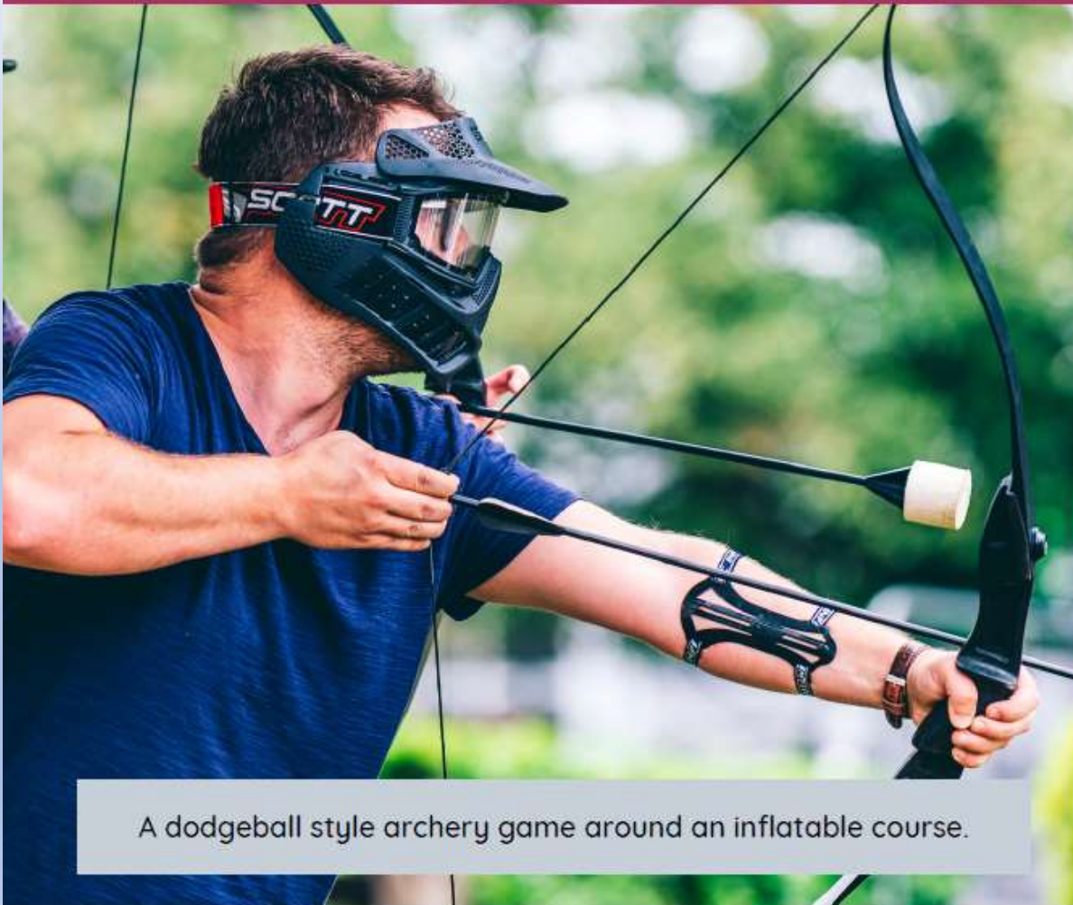
A dodgeball style archery game around an inflatable course.

Learn how to consistently hit a target from 10+ metres away.